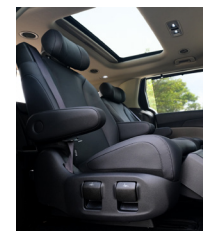
Better and Improved Premium Relaxation Seats