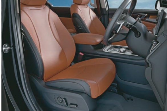
12-way Powered Driver Seats with 4-way Lumbar Support & Memory Function