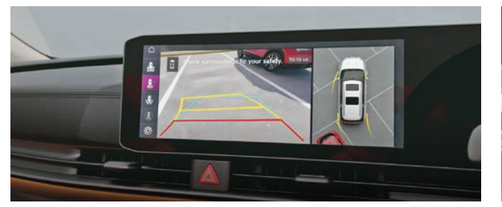
360-degree Camera with Blind View Monitor