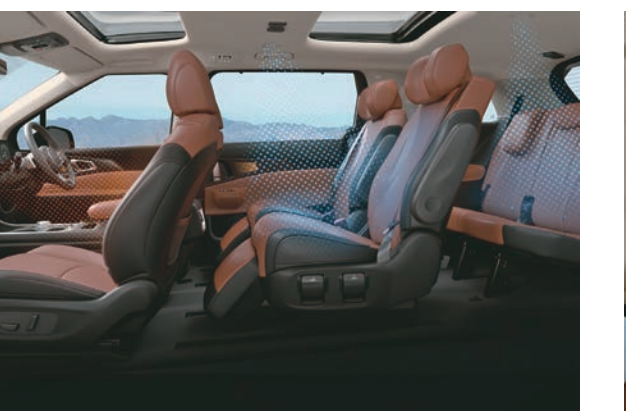
Independently Controlled 3-zone Fully Automatic Temperature Control

Find your oasis of calm no matter where you are. Once you enter the Carnival Limousine, the rest of the world falls away.