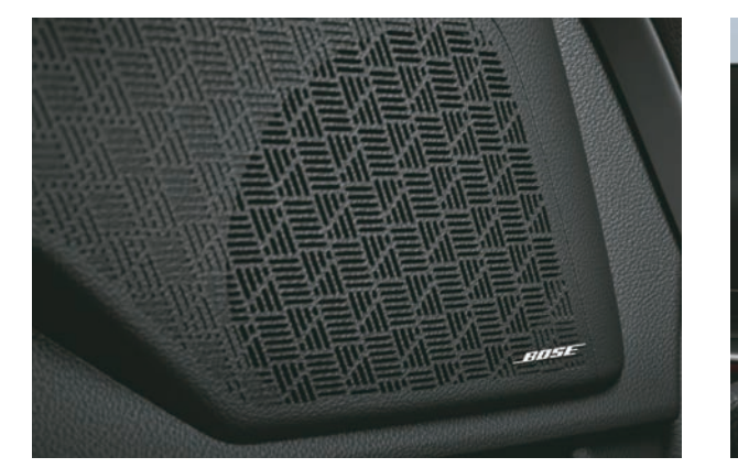
12-speaker BOSE Premium Sound System