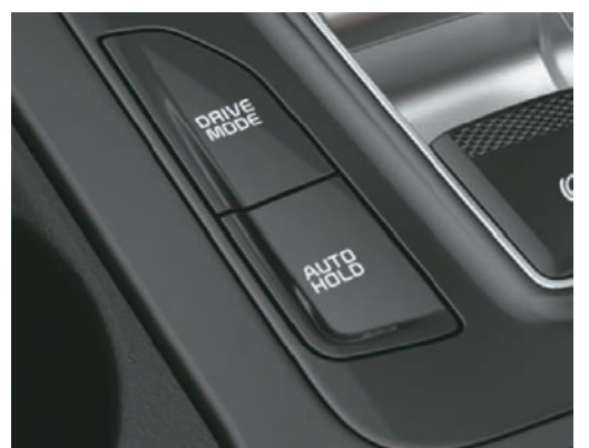
Multiple Drive Modes & Auto Hold