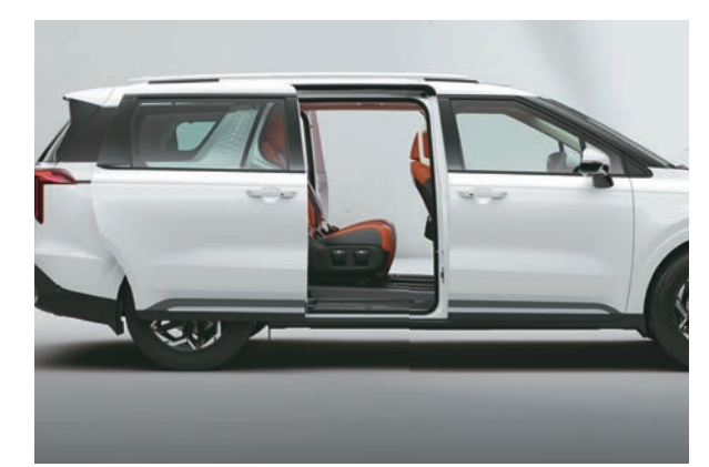
Smart Power Sliding Doors