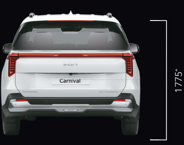
#With Roof Rails