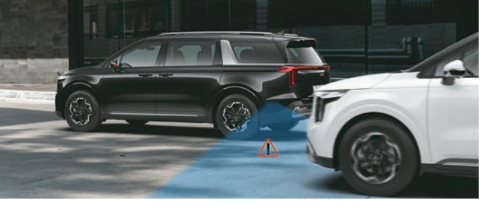
Safe Exit Warning & Assist