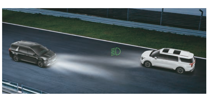
High Beam Assist