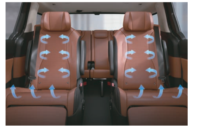
2<sup>nd</sup> Row Powered Relaxation Seats with Ventilation, Heating & Leg Support