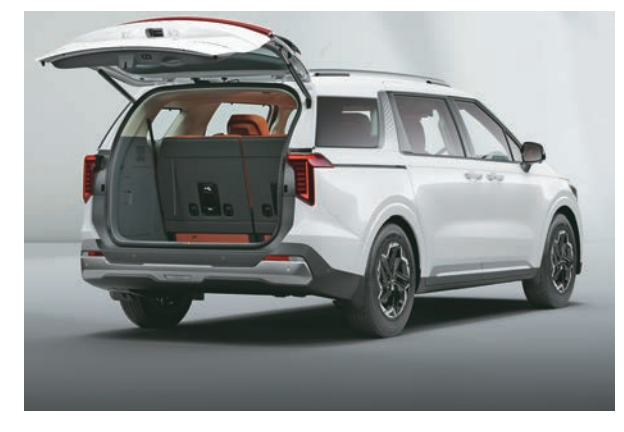
Smart Power Tailgate