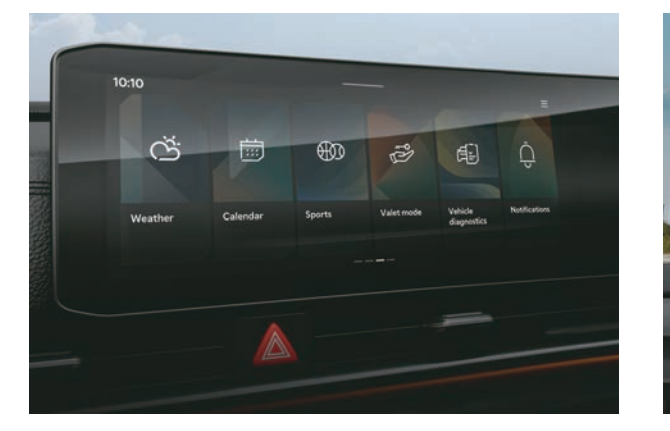
31.24 cm (12.3") HD Touchscreen Display

Be it the panoramic display or advanced instrumentation, the new Carnival Limousine is packed with intuitive technology. Built with effortless operation in mind, it gives you full control at all times.