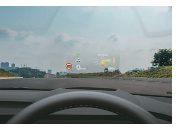
27.94 cm (11") Advanced Head-up Display