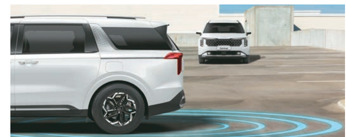
Rear Cross-traffic Collision Warning & Avoidance Assist