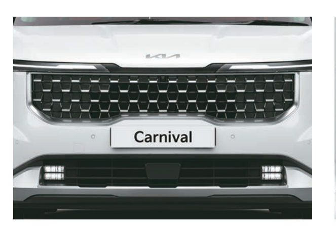
Black & Chrome 'Tiger Nose' Grille

The new Carnival Limousine is more than a car; it's a sublime experience. It places you in the lap of luxury and envelops you in opulence. With a bold exterior and striking looks that give the car a dignified stance, it leaves a powerful impression wherever it goes.