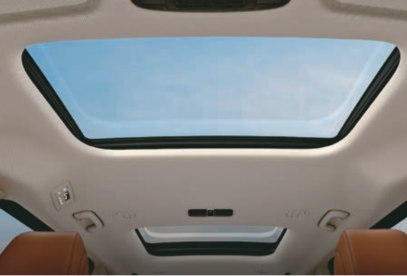
Wide Electric Dual Sunroof