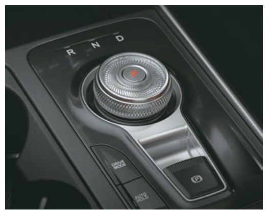
Shift-by-wire (dial type)