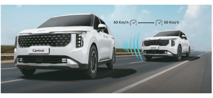
Smart Cruise Control with Stop/ Go