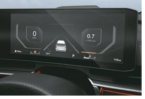
31.24 cm (12.3") HD Display Instrument Cluster