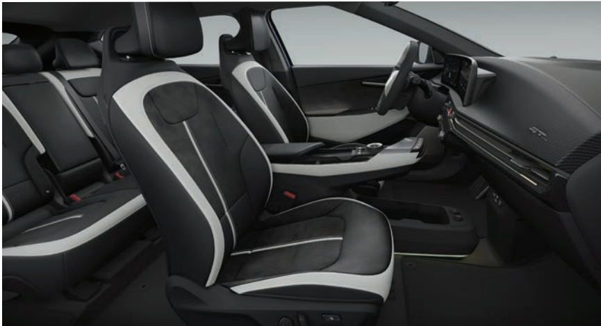
Saturn Black + Off white