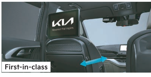
give the freedom to choose your entertainment and adjust your space.