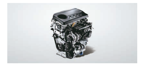
makes your drive more powerful with enhanced performance and takes on the road like no one has.