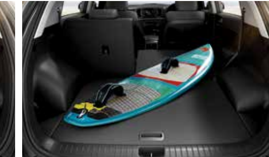
60:40 split folding rear seats The foldable rear seats allow for loading extra-sized items that would not normally fit in the rear cargo space.