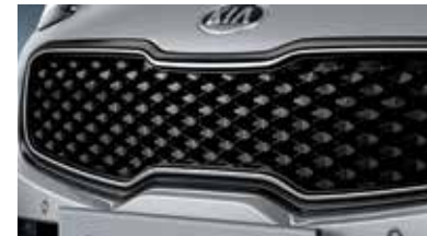
High-gloss black paint