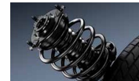
Suspension The design and geometry of the Sportage's improved suspension offers even more stable handling at high speeds for your safety and enhanced driving comfort.