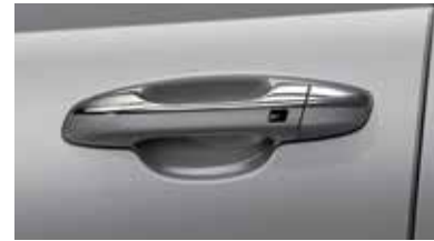
Chrome outside handles