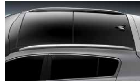
Roof rack The integrated roof rack is designed for maximum luggage storage while additional accessory cross bars offer you extra utility.