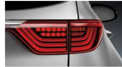
LED-type rear combination lamps

These additional styling and convenience features were created out of our passion for addressing even the finest details.