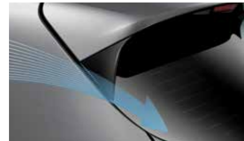
Aerodynamic improvements The smart rear-spoiler side garnish minimizes the drag coefficient for improved fuel efficiency while a state-of-the-art wheel air curtain improves the flow of air around the front wheels to offer you a more comfortable driving experience.