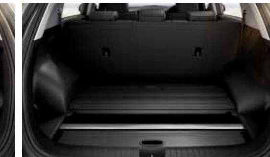
Cargo screen storage compartment The retractable cargo screen can be conveniently stowed away in a partitioned-off space under the floorboard.