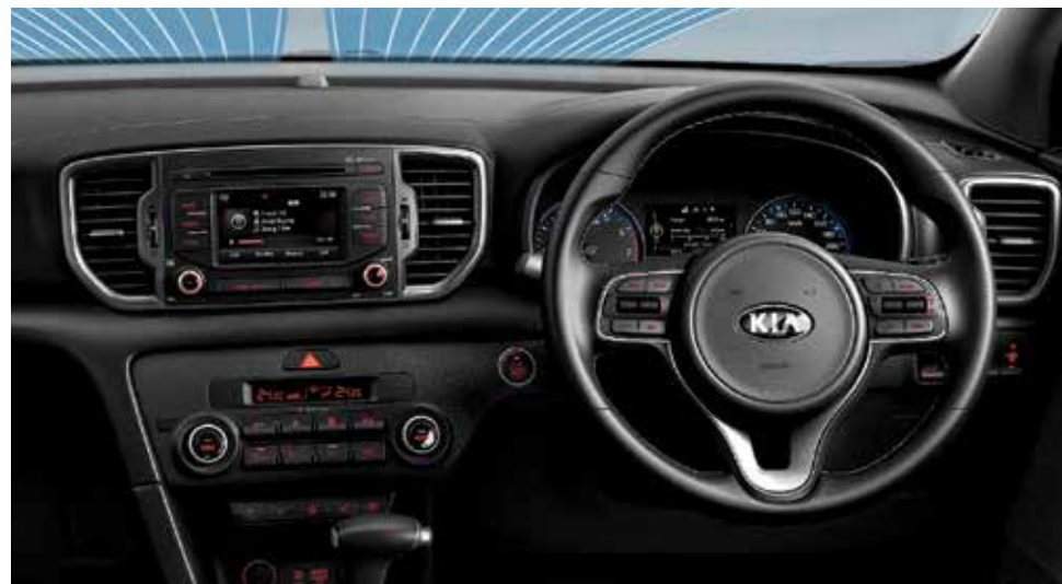
Bluetooth Steering-wheel mounted controls enable you to effortlessly stay connected while on the move.