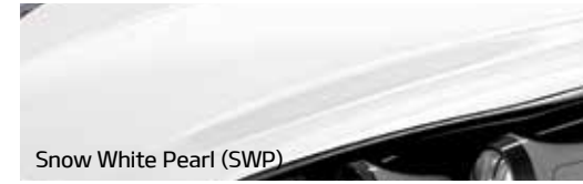
Snow White Pearl (SWP)