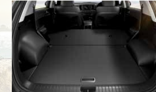
Fully-folding rear seats Rear seats fold completely flat to transport cargo more easily and safely.