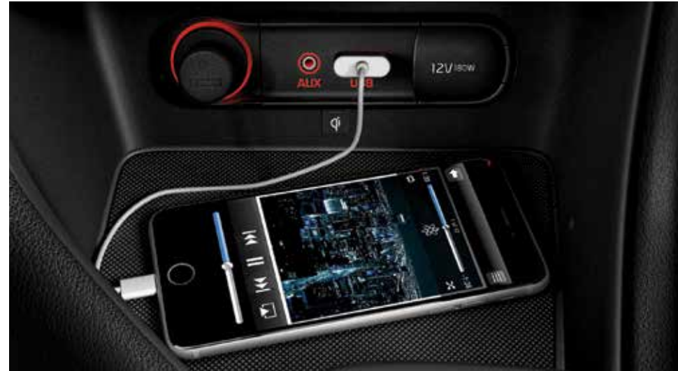
AUX & USB ports You and your passengers can connect USBs or other mobile devices for convenient music playback.