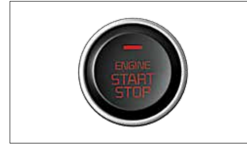
Button start / stop For convenience and safety, you don't have to take the key fob out of your pocket when you're locking or unlocking the door, starting the engine or disengaging the immobilizer.