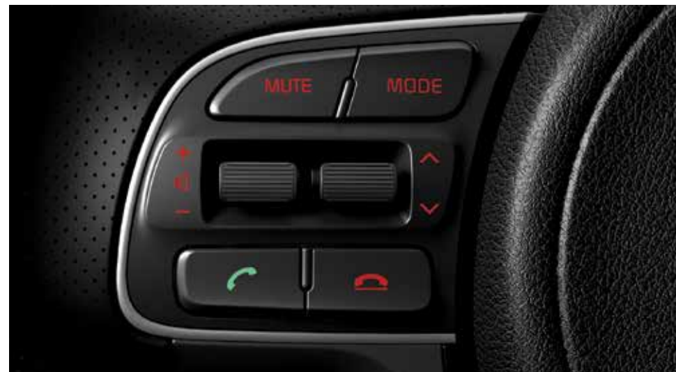
Audio remote control Fingertip control of the sound system means you will never be distracted from the road ahead.