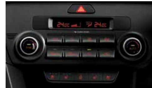
Dual-zone Full Auto Temperature Control (D-FATC) Separate temperatures can be set according to driver and front seat passenger preferences, enhancing comfort for all.