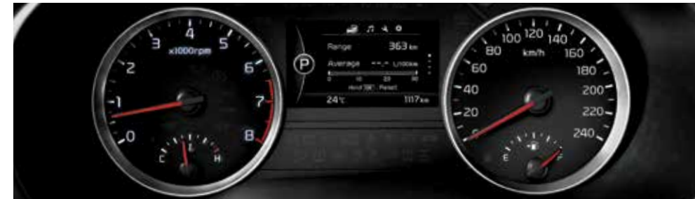
Tyre Pressure Monitoring System (TPMS) Allows you to quickly and easily check the air pressure in your tyre.