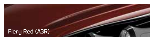
Fiery Red (A3R)