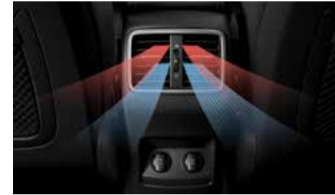
Ventilation and USB charger for 2 nd row passengers Cold or warm air is available when needed and your rear seat passengers can also recharge your devices on the go.