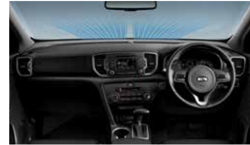
Auto defogger A sophisticated sensor detects fogging on the front windshield and clears it automatically, giving you driving clarity at all times.