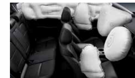
6 airbags Airbags placed strategically throughout the interior offer protection for you and your passengers in the event of a collision.