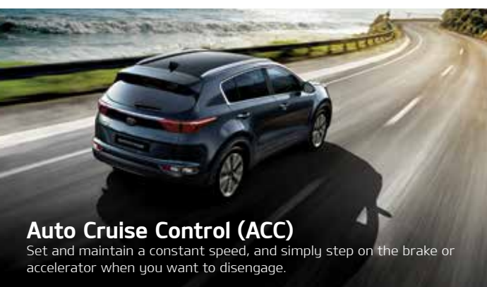
Auto Cruise Control (ACC) Set and maintain a constant speed, and simply step on the brake or accelerator when you want to disengage.