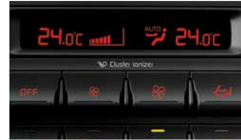
Cluster ionizer A smart ion generator is ever-ready to remove the sources of unpleasant smells, clearing the interior air for an enjoyable ride.