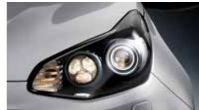
Halogen headlamps with bulb-type DRL