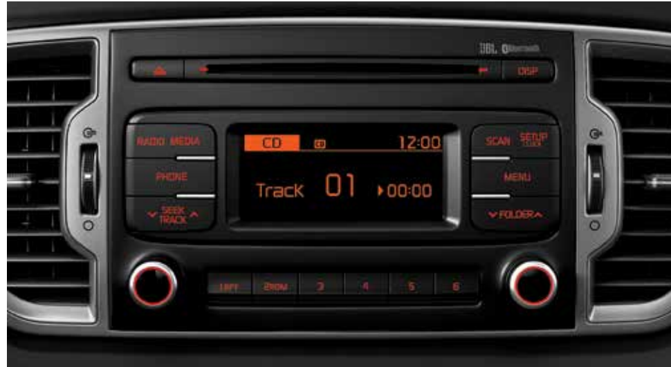
3.8" monochrome screen audio Experience enhanced audio using the 3.8-inch monochrome screen designed for easy access and control.

Step into a world of high-tech driver convenience features with the Sportage bringing out a whole new level of sporty sophistication.