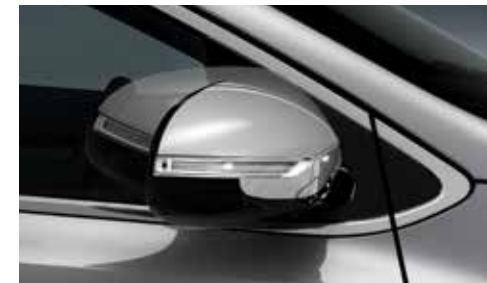
Smart welcome system Approach your vehicle with the smart key fob and the Sportage springs into life once you're comfortably within range. Welcome lights turn on and the outside mirrors unfold into position so that you're ready to be on the move again.