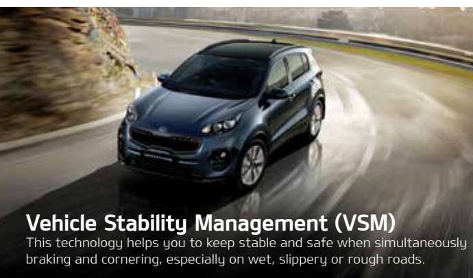
Vehicle Stability Management (VSM) This technology helps you to keep stable and safe when simultaneously braking and cornering, especially on wet, slippery or rough roads.