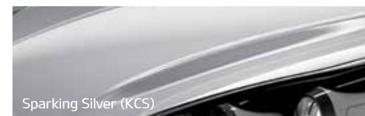
Sparking Silver (KCS)