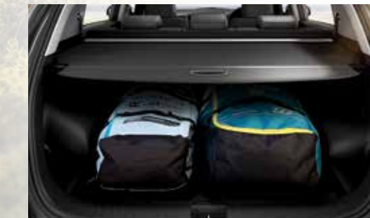
Dual-level luggage board Increased cargo space height enables you to load even more extra-large items.