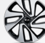
17-inch Alloy Wheel