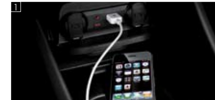
1. Aux / USB port Input ports catering to every kind of personal music device provide maximum connectivity.

Racing through the urban nightscape with its high agility, Rio offers the ultimate smart driving experience. Equipped with state of the art infotainment system which is not a mere option but a prerequisite for Rio, it yet has much more to offer with the dual connection ports that enable any type of external music device to be plugged in.