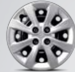
14-inch Steel Wheel