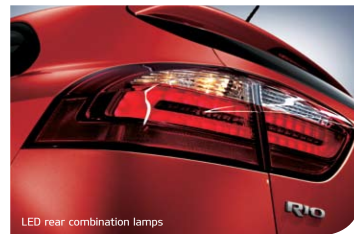
LED rear combination lamps