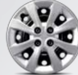
15-inch Steel Wheel