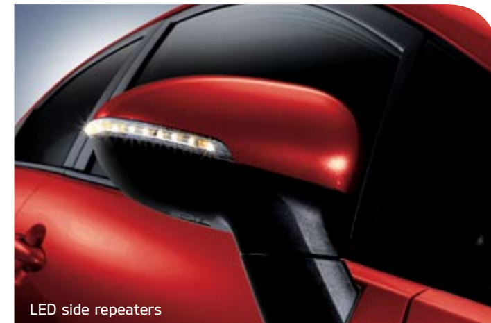
LED side repeaters

Emanating flair from every angle, the Rio's low, wide stance and short overhangs give it a strong, youthful identity all of its own.