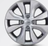
15-inch Alloy Wheel