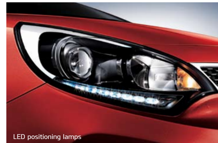
LED positioning lamps