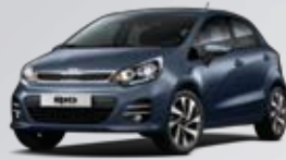
BLA_Formal Deep Blue